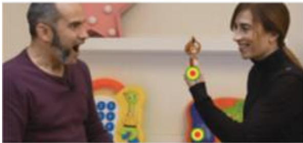
Figura 1. Seguimiento visual TEA