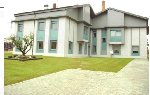
El Olivo House