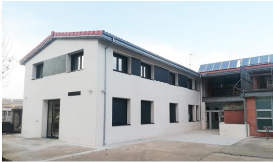
Early Intervention Center